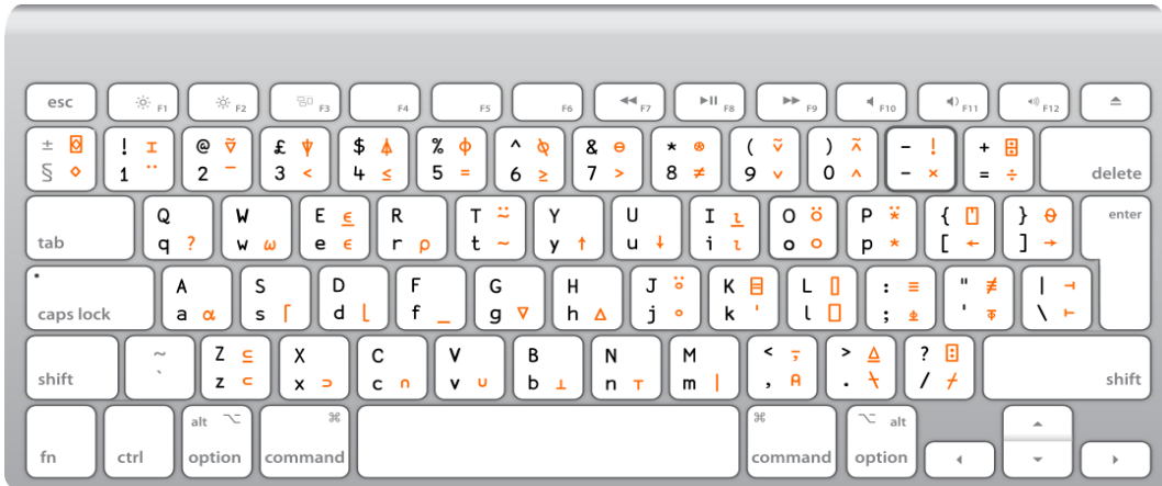
Figure A-1: The default Session keyboard key mappings (UK keyboard)

The keyboard key mappings shown in Figure A-1 are enabled whenever a Dyalog Session is started.