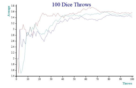
Figure C-1: Graphical representation of cumulative averages